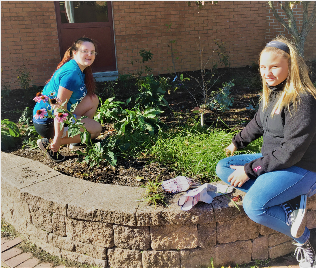
Students weeding their garden at Talley Middle School, Wilmington, DE

No matter what the groundhog said in February, spring will always arrive! It has its ups and downs (temperature wise), and it is frequently referred to as "mud" season here in the Delaware Valley, but this wet season is necessary for many of our native plants to survive the coming hot/dry summer. In this Issue of Perennial Pages, we have tips for helping your plants get the best start during this new season, as well as a list of native plants sales for filling out your habitats, a new field guide to wetland plants, and our regular Space Invaders and "What's Up?" features! Enjoy!