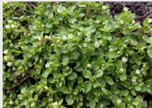
Common Chickweed

Common Chickweed ( Stellaria media ) is a common early spring "weed," that should be tackled early in the season to avoid it taking over the garden later. Chickweed is also edible,