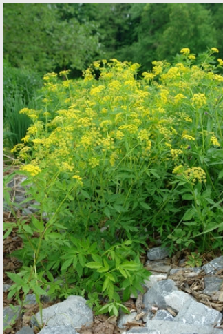
Golden Alexanders

As spring inches closer, you are probably anxiously awaiting the first